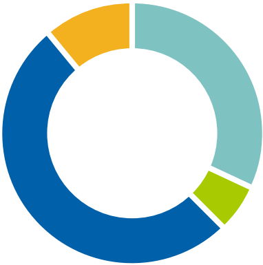
Diverse Shoppers at Montclair Place