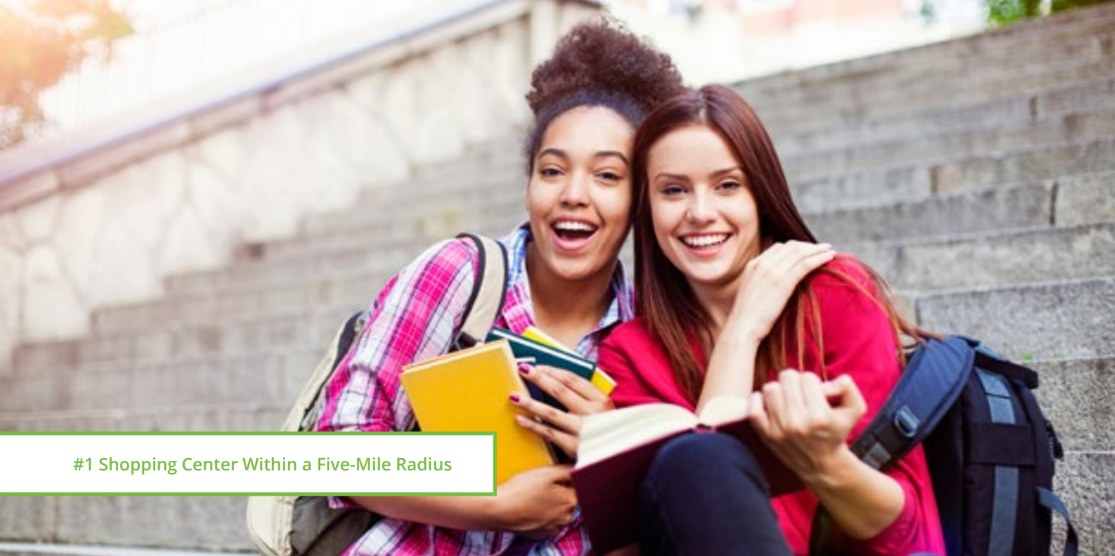
#1 Shopping Center Within a Five-Mile Radius